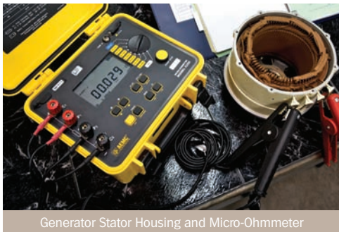
Generator Stator Housing and Micro-Ohmmeter